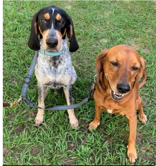
Lou, blue-tick hound (left) and Ruby, red-bone hound (right)